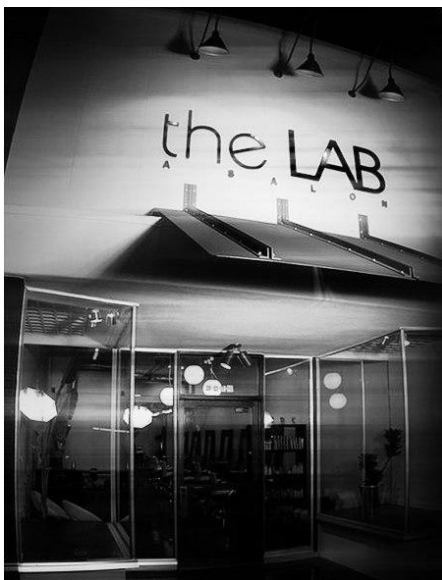
Paradise for the stylish: The Lab A Salon greets customers with a welcoming urban aesthetic.

The Lab A Salon San Diego, CA 92104 (619) 543-9952 www.thelabasalon.com